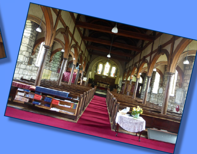
The beautiful interior is remarkable for its double row of elegant oak columns

Entries from the Churchwardens' Accounts of 1735 showing work done on the (then) new bells