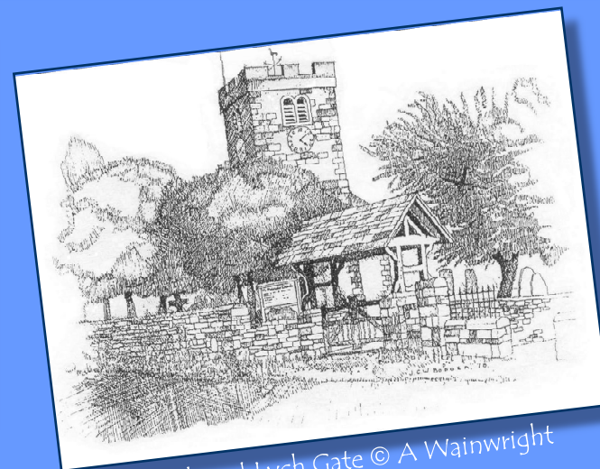
Church and Lych Gate